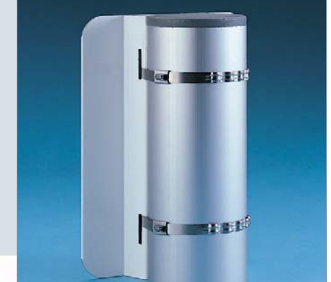
SIGN HANGING APPLICATION