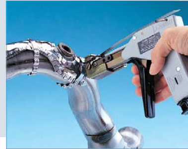
HEAT SHIELD APPLICATION